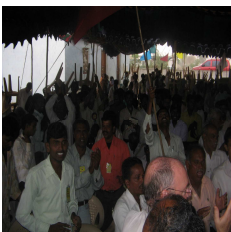
Worshiping God during the graduation ceremonies

We have gotten to know some neighbors behind our condo, and spent 4th of July having a BBQ with them. She has already asked us to pray for her. We feel called to be Jesus to our neighborhood.