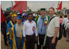
Getting ready for the graduation procession in Hyderabad, India. There were about 1,000 graduates from this church planting school, The Timothy Initiative

I know that I am not alone when I am amazed at God's grace in my life! His goodness in allowing me to be a bondservant for the expansion of His Kingdom. As partners with us in this ministry, you are also participating in the expansion of God's Kingdom.